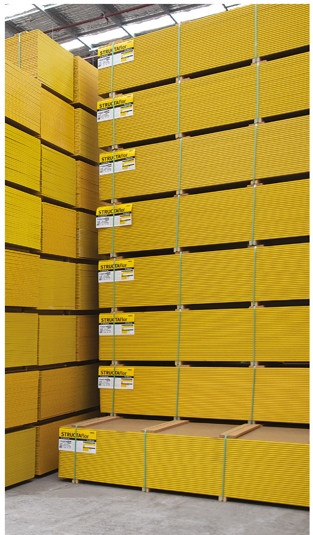
STRUCtAflor General Purpose Structural Flooring