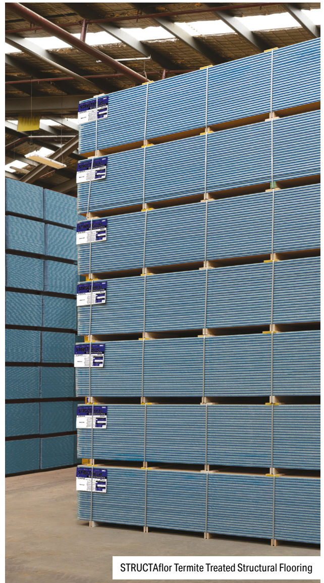
STRUCTAflor Termite Treated Structural Flooring